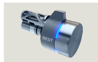
Switch™ Tech Electronic Access Platform