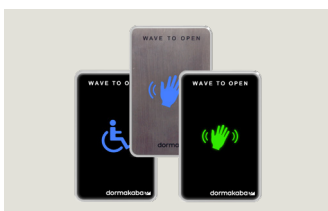
RCI Touchless Actuator Switch

Simplified Solutions for Access Protocols