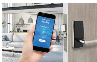
BlueSky Mobile Access